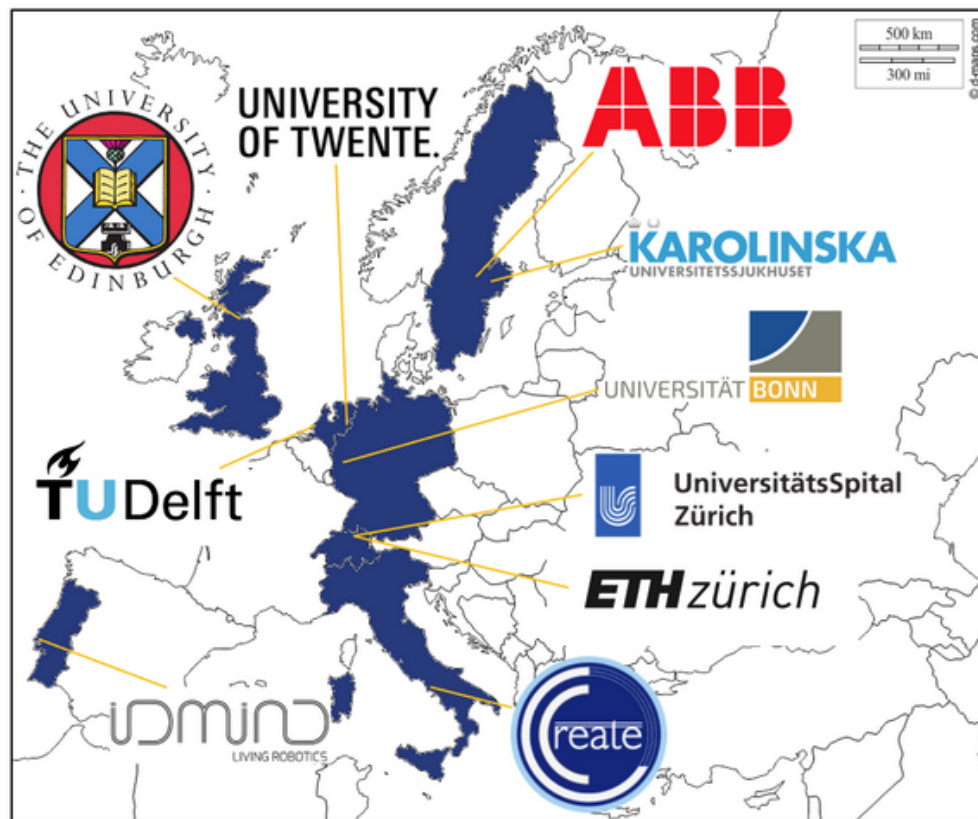
Figure 1 Consortium. We are a diverse and interdisciplinary team consisting of 5 universities, 1 research organisation, 1 multinational company, 1 SME and 2 hospitals participating from across 7 European nations.

The website offers an overview of the HARMONY project, its objectives and progress. Additionally, the participating consortium members are listed (Figure 1).